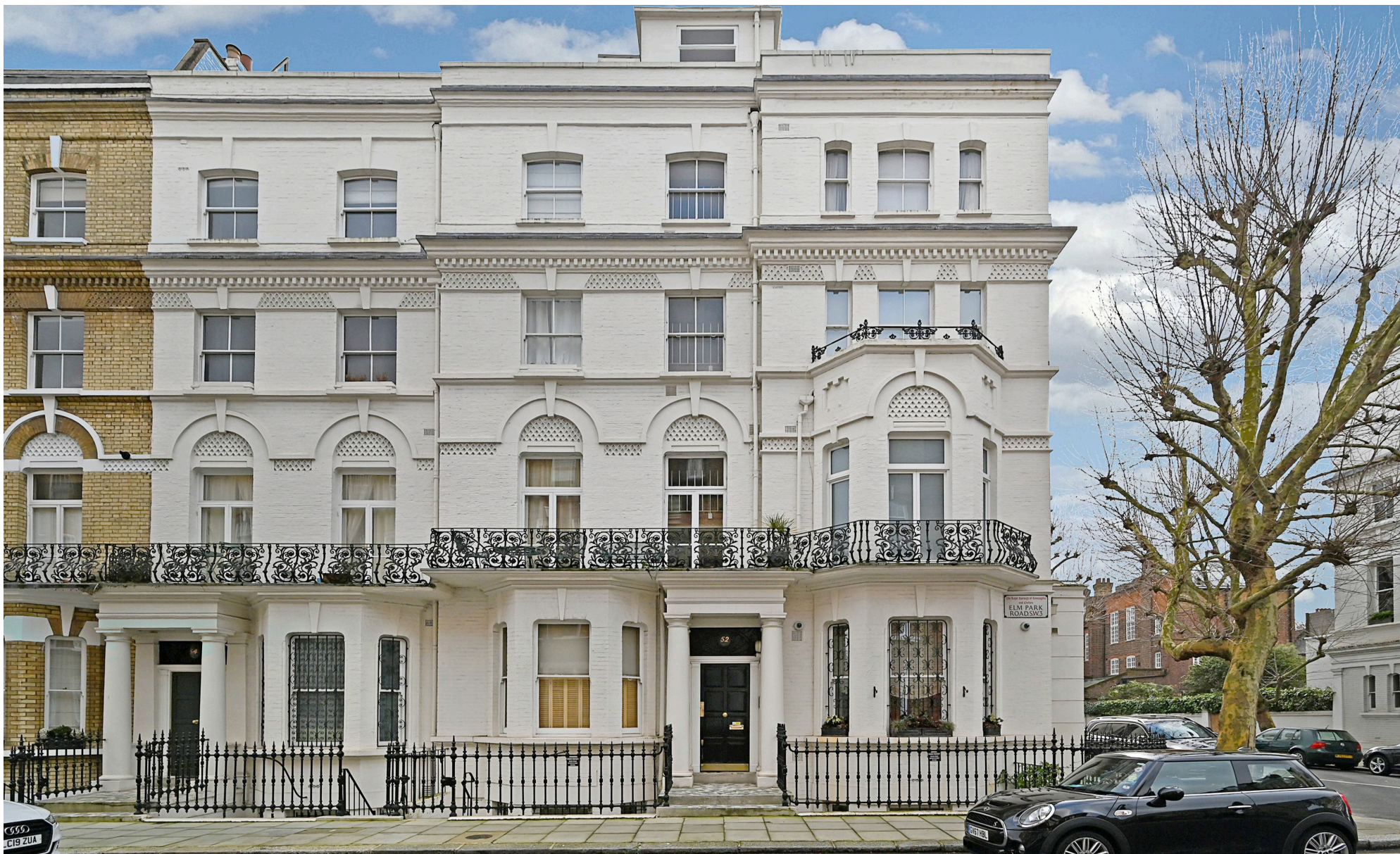
Elm Park Road, Chelsea, SW3